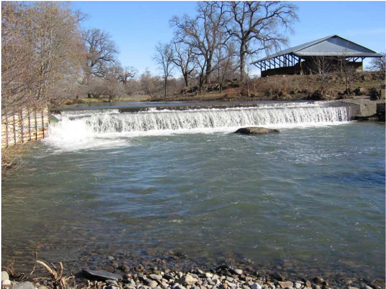
Millville Dam: Barrier to Adult Fall Chinook and Steelhead, Cow Creek Watershed, Shasta County